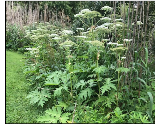
(Giant hogweed; Tier 1 noxious weed)

A noxious weed is any living plant, or part thereof, declared by the Board of Agriculture to be detrimental to crops, surface waters, including lakes, or other desirable plants, livestock, land, or other property, or to be injurious to public health, the environment, or the economy, except when in-state production of such living plant is commercially viable or is commercially propagated in Virginia. (VA Code 3.2-800 et seq.)