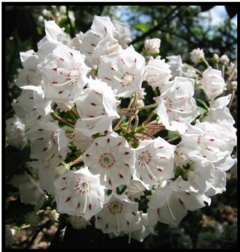
(Mountain laurel)

Native plants, including trees, shrubs, vines and flowers, support and feed native wildlife that is essential for maintaining biodiversity. Native plants have co-evolved with wildlife for many years, resulting in unique relationships between insects, birds, and other animals. Native plants provide wildlife with the food and shelter that is